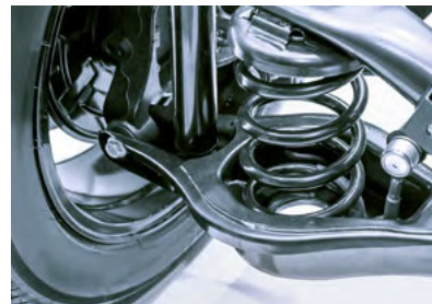
Highly ductile microalloyed steel for wheel chassis parts.

HD steels offer a narrow range of mechanical properties as well as increased elongation after fracture compared to the standard. To put it briefly: Our perform® HD grades are there for you! They meet VDA 239-100 and DIN EN 10149-2 standards, and are available in yield strength variants from 315 to 550 MPa.